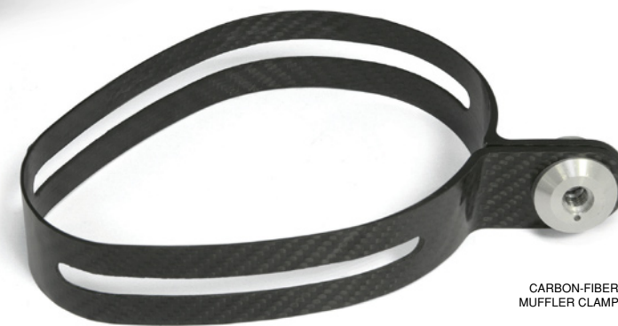
CARBON-FIBER MUFFLER CLAMP