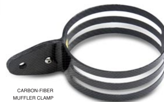
CARBON-FIBER MUFFLER CLAMP