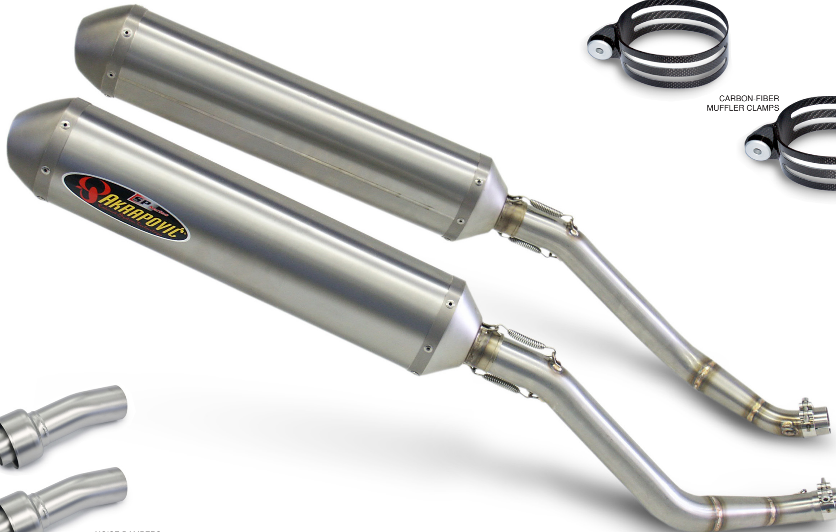
CARBON-FIBER MUFFLER CLAMPS